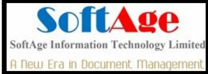
Softage Information Technology