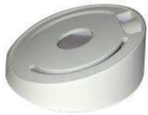
Inclined ceiling mount DS-1259ZJ