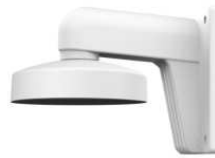
Wall mount DS-1272ZJ-110